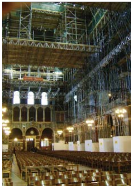
Scaffolding throughout Westminster Cathedral, London

The Festival always provides opportunities for composers and performers to discuss about new organ music and how they can help to promote such new music to audiences. The importance of the relationship between composers and performers was well illustrated during Jennifer Bate's conference on her experience working