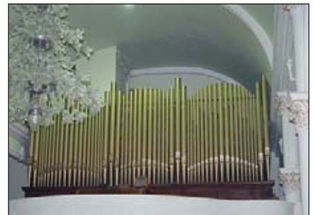
Casavant organ Église Sainte-Anne

The word noël as a reference to the birth of Jesus Christ dates from the 13 th century. By the 15 th and 16 th centuries the word was used as an exclamation and greeting during Christmas celebrations, as well as to describe a song or carol that incorporated some mention of the Christmas story. For instance, noëls often tell the stories of shepherds visiting Mary, Joseph and the Child and celebrating the birth with rustic instruments such as tambourines and pipes. Most noëls are parodies of vernacular poetry and in some cases are based on drinking songs and dance melodies that would have been well known in households and communities at the time. Collections of these lyrics and music were often printed and sold in the street to common folk for use during Christmas celebrations.