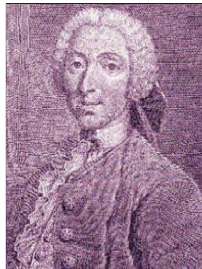
Louis-Claude Daquin (1694-1772)

Eglise Sainte-Anne is located at 528 Old St. Patrick between Coburg St. and Beausoleil Drive. Admission is by free-will donation.