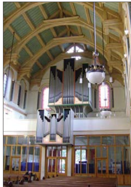
J.W. Walkers & Sons organ, St. John's Church, Islington (London)