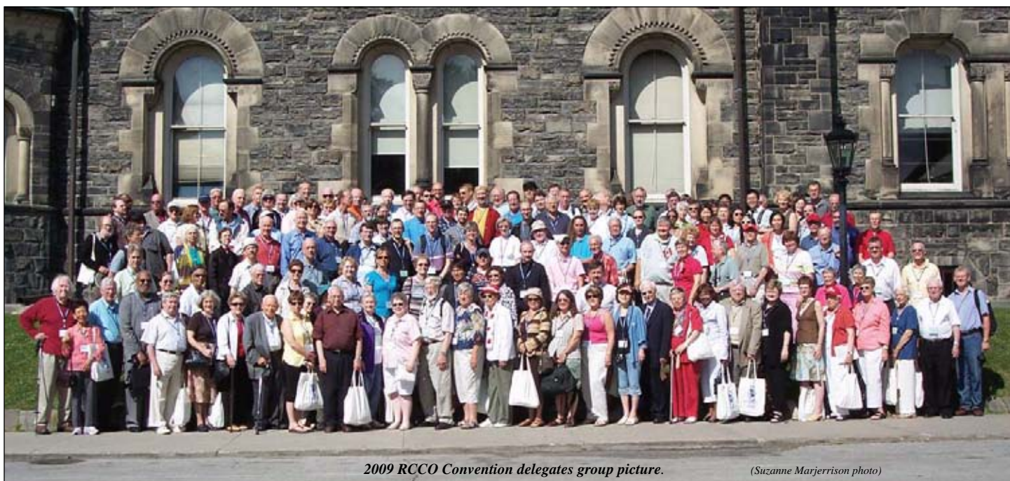
2009 RCCO Convention delegates group picture.