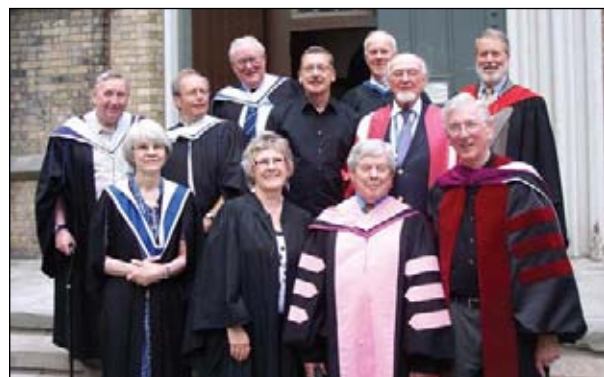
RCCO National Past Presidents