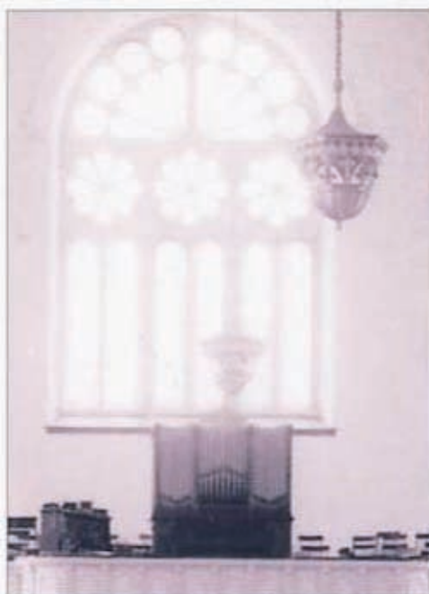
This 1917 photo shows the newly-installed Estey K 59 under the famous rear window of St-François-d'Assise church

In this first installment, we see the beginning of the rich musical history at St-François-d'Assise church.