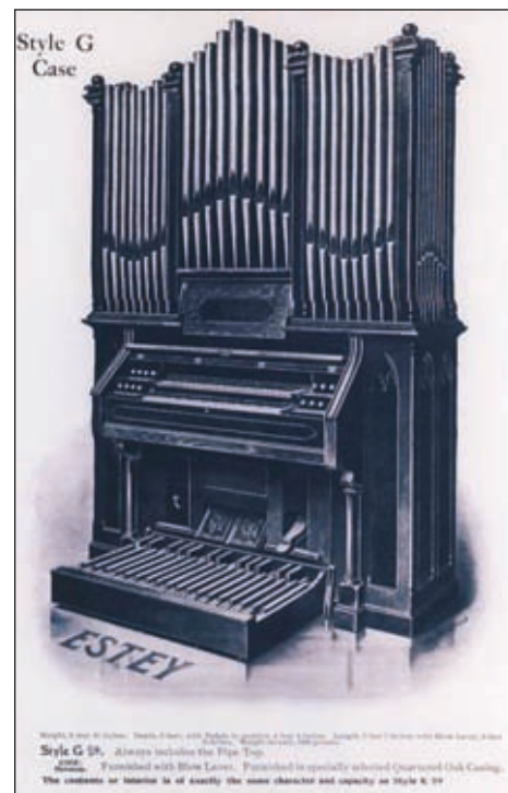
The G 59 model featured in Estey's 1917 organ catalog. The K model installed at St-François-d'Assise church differed only in the detail on the façade pipework and slight differences in the names of the pipes indicated on the stop list.

If you have an interesting story from your church or would like to have Bill research the history of your church organ, contact Bill at 613-224-1553 or via email at billvin@travel-net.com